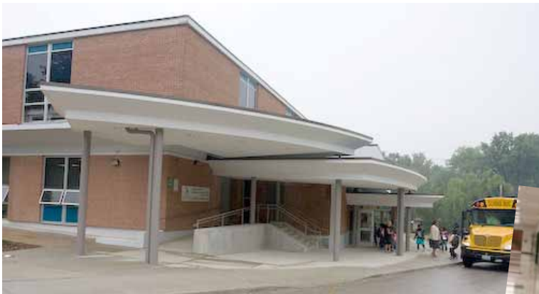
Above, a new entrance at Briar Crest Elementary enhanced safety and allowed for more classroom space. At right, the nurse's office at Willow Brook Elementary was expanded to allow more room to isolate and tend to sick students.