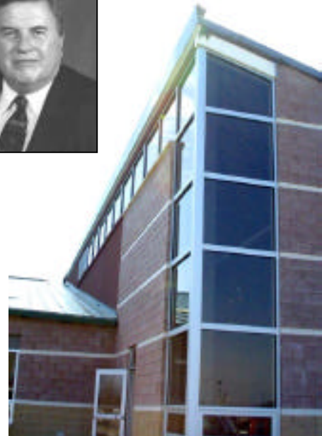
Above, a view of Robert Drummond Elementary, currently under construction, and a photo of the school's namesake.

"There's only one thing to say, and that's 'Thank you,'"