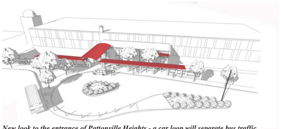
New look to the entrance of Pattonville Heights - a car loop will separate bus traffic from the parent drop-off and pick-up area.

Good management of funds from a bond issue passed by voters in 2000 has enabled the Pattonville School District to save about $3 million, enough money to hire an architectural firm and complete a list of projects that will enhance safety and security at its elementary and middle schools, along with a few other renovation projects. These projects are over